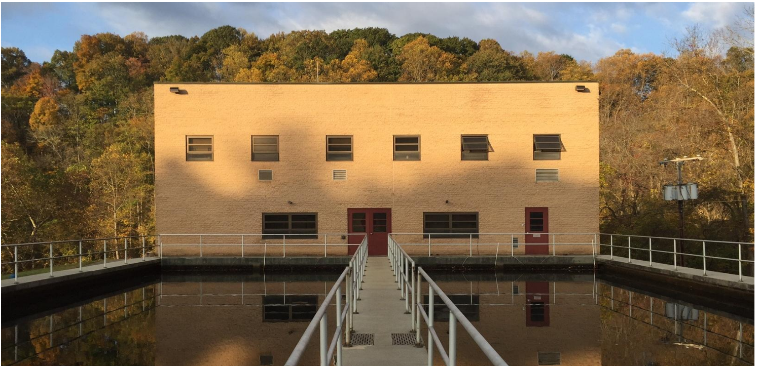
A view of our twin settling basins. This is where most of the particulate matter is removed.