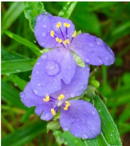
Wildflowers living along the river bank

Some people may be more vulnerable to contaminants in drinking water than the general population. Immuno-compromised persons such as persons with cancer undergoing chemotherapy, persons who have undergone organ transplants, people with HIV/AIDS or other immune system disorders, some elderly, and infants can be particularly at risk from infections. These people should seek advice about drinking water from their health care providers. EPA/CDC guidelines on appropriate means to lessen the risk of infection by Cryptosporidium and other microbiological contaminants are available from the Safe Drinking Water Hotline (800-426-4791).