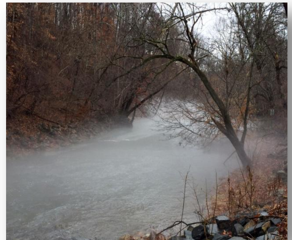
The Blackwater River

Some people may be more vulnerable to contaminants in drinking water than the general population. Immuno-compromised persons such as persons with cancer undergoing chemotherapy, persons who have undergone organ transplants, people with HIV/AIDS or other immune system disorders, some elderly, and infants can be particularly at risk from infections. These people should seek advice about drinking water from their health care providers. EPA/CDC guidelines on appropriate means to lessen the risk of infection by Cryptosporidium and other microbiological contaminants are available from the Safe Drinking Water Hotline (800-426-4791).