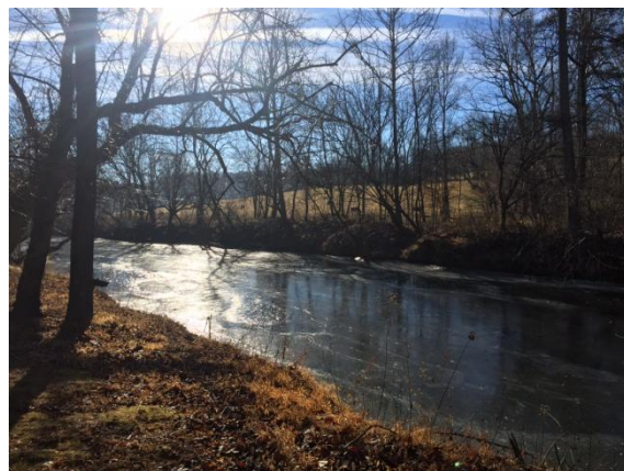
Iced over during the deep freeze of 2018

Our source water quality can vary widely from day to day. The Blackwater River floods over the banks on average about once a year. If water demand can be supplied with water already produced and in the system we will shut the plant down and allow flood waters to recede. But if needed, your experienced staff can make high quality drinking water when the river is less than optimal.