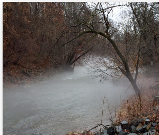
The Blackwater River