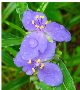
Wildflowers living along the river bank

Some people may be more vulnerable to contaminants in drinking water than the general population. Immuno-compromised persons such as persons with cancer undergoing chemotherapy, persons who have undergone organ transplants, people with HIV/AIDS or other immune system disorders, some elderly, and infants can be particularly at risk from infections. These people should seek advice about drinking water from their health care providers. EPA/CDC guidelines on appropriate means to lessen the risk of infection by Cryptosporidium and other microbiological contaminants are available from the Safe Drinking Water Hotline (800-426-4791).