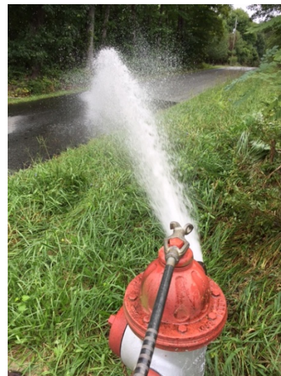
One of the things we do to keep water from becoming stale is to flush hydrants. This is also beneficial to our fire department as it exercises valves and provides a record of pressure and flow that can be expected from each hydrant.