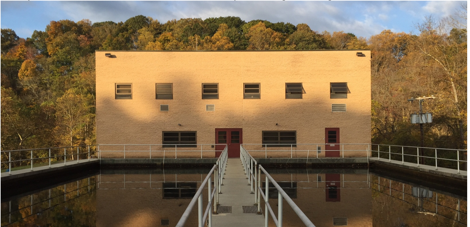
A view of our twin settling basins. This is where most of the particulate matter is removed.