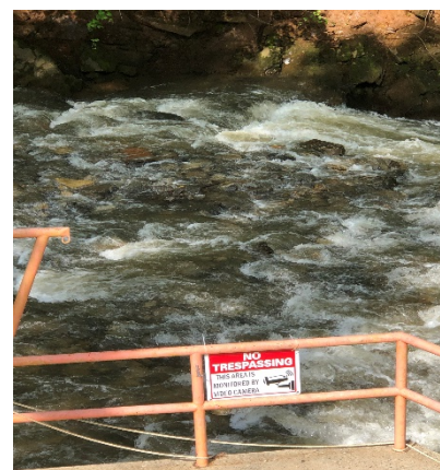
Downstream of the Blackwater Dam, the rocks have been restored for safety after the two Hurricanes washed them away in 2018. All canoes must portage around this dam.

We routinely monitor for various contaminants in the water supply to meet all regulatory requirements. The table lists only those contaminants that had some level of detection. Many other contaminants have been analyzed but were not present or were below the detection limits of the lab equipment.